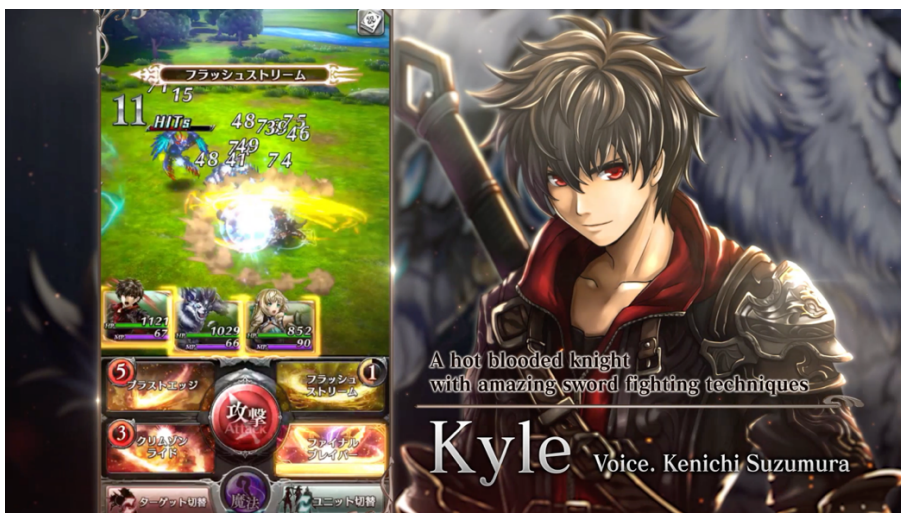
Unique and charming characters and their interaction builds up the cinematic story