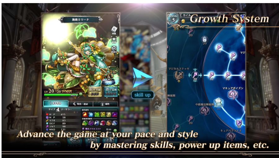
Highly flexible and customizable Character Growth System