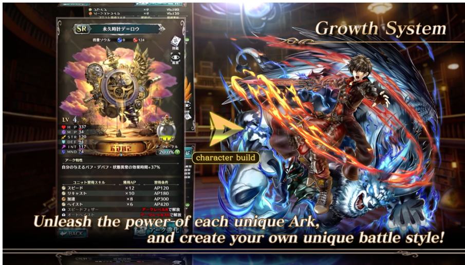
Equipping Ark items to tailor your own battle style